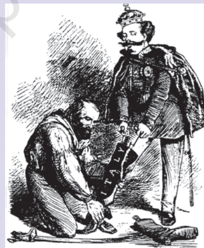
Fig. 15 – Garibaldi helping King Victor Emmanuel II of Sardinia-Piedmont to pull on the boot named ‘Italy’. English caricature of 1859.

In 1867, Garibaldi led an army of volunteers to Rome to fight the last obstacle to the unification of Italy, the Papal States where a French garrison was stationed. The Red Shirts proved to be no match for the combined French and Papal troops. It was only in 1870 when, during the war with Prussia, France withdrew its troops from Rome that the Papal States were finally joined to Italy.