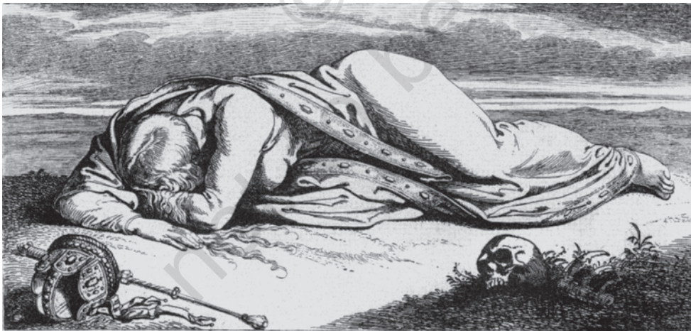
Fig. 18 – The fallen Germania , Julius Hübner, 1850.