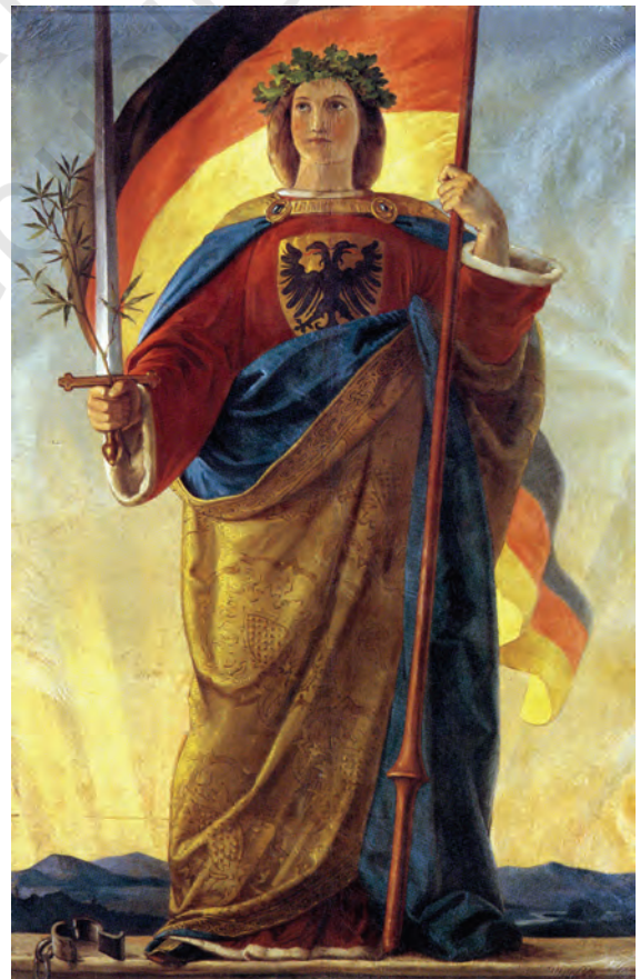
Fig. 17 – Germania, Philip Veit, 1848. The artist prepared this painting of Germania on a cotton banner, as it was meant to hang from the ceiling of the Church of St Paul where the Frankfurt parliament was convened in March 1848.