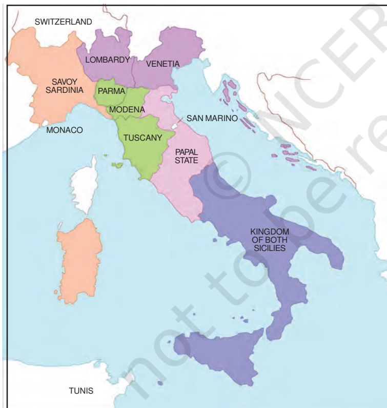
Fig. 14(a) – Italian states before unification, 1858.

Examine Fig. 14(b). Which was the first region to become a part of unified Italy? Which was the last region to join? In which year did the largest number of states join?