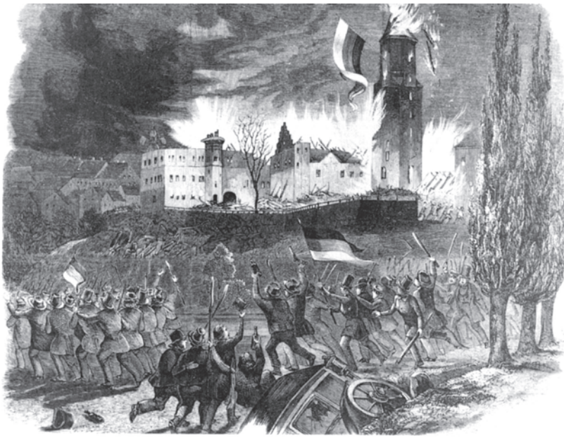
Fig. 9 – Peasants' uprising, 1848.

National Assembly proclaimed a Republic, granted suffrage to all adult males above 21, and guaranteed the right to work. National workshops to provide employment were set up.