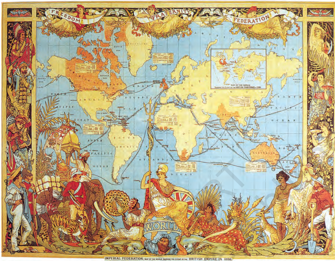
Fig. 20 – A map celebrating the British Empire. At the top, angels are shown carrying the banner of freedom. In the foreground, Britannia — the symbol of the British nation — is triumphantly sitting over the globe. The colonies are represented through images of tigers, elephants, forests and primitive people. The domination of the world is shown as the basis of Britain’s national pride.

Nationalism, aligned with imperialism, led Europe to disaster in 1914. But meanwhile, many countries in the world which had been colonised by the European powers in the nineteenth century began to oppose imperial domination. The anti-imperial movements that developed everywhere were nationalist, in the sense that they all struggled to form independent nation-states, and were inspired by a sense of collective national unity, forged in confrontation with imperialism. European ideas of nationalism were nowhere replicated, for people everywhere developed their own specific variety of nationalism. But the idea that societies should be organised into ‘nation-states’ came to be accepted as natural and universal.