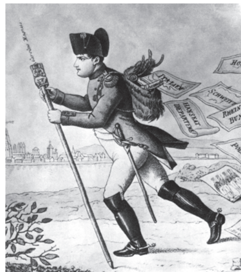
Fig. 5 – The courier of Rhineland loses all that he has on his way home from Leipzig.

However, in the areas conquered, the reactions of the local populations to French rule were mixed. Initially, in many places such as Holland and Switzerland, as well as in certain cities like Brussels, Mainz, Milan and Warsaw, the French armies were welcomed as harbingers of liberty. But the initial enthusiasm soon turned to hostility, as it became clear that the new administrative arrangements did not go hand in hand with political freedom. Increased taxation, censorship, forced conscription into the French armies required to conquer the rest of Europe, all seemed to outweigh the advantages of the administrative changes.