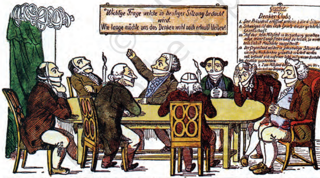
Fig. 6 – The Club of Thinkers, anonymous caricature dating to c. 1820.

What is the caricaturist trying to depict?