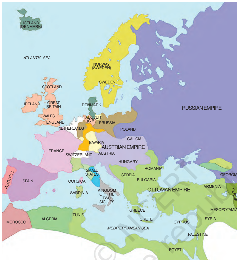
Fig. 3 – Europe after the Congress of Vienna, 1815.

Within the wide swathe of territory that came under his control, Napoleon set about introducing many of the reforms that he had already introduced in France. Through a return to monarchy Napoleon had, no doubt, destroyed democracy in France, but in the administrative field he had incorporated revolutionary principles in order to make the whole system more rational and efficient. The Civil Code of 1804 – usually known as the Napoleonic Code – did away with all privileges based on birth, established equality before the law and secured the right to property. This Code was exported to the regions under French control. In the Dutch Republic, in Switzerland, in Italy and Germany, Napoleon simplified administrative divisions, abolished the feudal system and freed peasants from serfdom and manorial dues. In the towns too, guild restrictions were removed. Transport and communication systems were improved. Peasants, artisans, workers and new businessmen