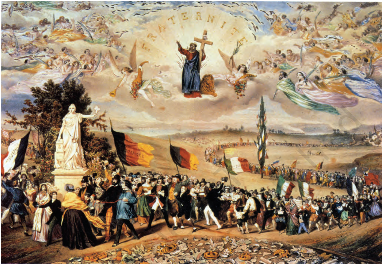
Fig. 1 – The Dream of Worldwide Democratic and Social Republics – The Pact Between Nations, a print prepared by Frédéric Sorrieu, 1848.

In 1848, Frédéric Sorrieu, a French artist, prepared a series of four prints visualising his dream of a world made up of ‘democratic and social Republics’, as he called them. The first print (Fig. 1) of the series, shows the peoples of Europe and America – men and women of all ages and social classes – marching in a long train, and offering homage to the statue of Liberty as they pass by it. As you would recall, artists of the time of the French Revolution personified Liberty as a female figure – here you can recognise the torch of Enlightenment she bears in one hand and the Charter of the Rights of Man in the other. On the earth in the foreground of the image lie the shattered remains of the symbols of absolutist institutions. In Sorrieu’s utopian vision, the peoples of the world are grouped as distinct nations, identified through their flags and national costume. Leading the procession, way past the statue of Liberty, are the United States and Switzerland, which by this time were already nation-states. France,