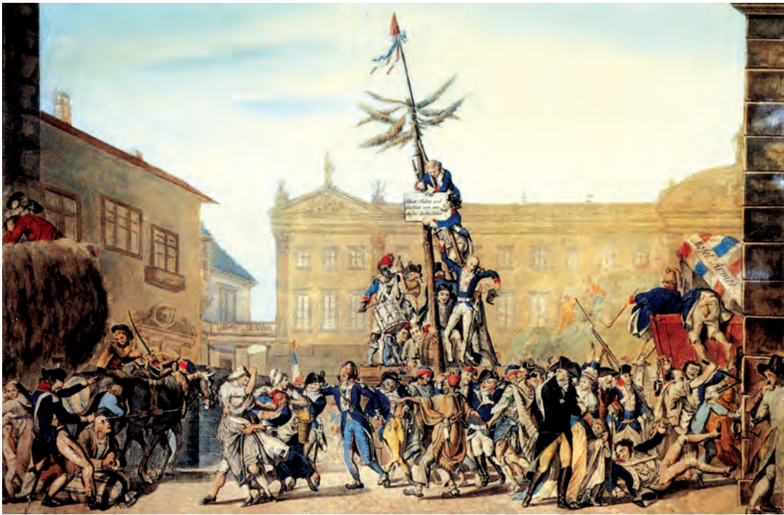
Fig. 4 – The Planting of Tree of Liberty in Zweibrücken, Germany.

The subject of this colour print by the German painter Karl Kaspar Fritz is the occupation of the town of Zweibrücken by the French armies. French soldiers, recognisable by their blue, white and red uniforms, have been portrayed as oppressors as they seize a peasant's cart (left), harass some young women (centre foreground) and force a peasant down to his knees. The plaque being affixed to the Tree of Liberty carries a German inscription which in translation reads: 'Take freedom and equality from us, the model of humanity.' This is a sarcastic reference to the claim of the French as being liberators who opposed monarchy in the territories they entered.