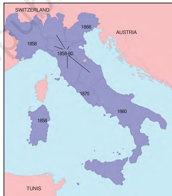
Fig. 14(b) – Italy after unification. The map shows the year in which different regions (seen in Fig 14(a)) become part of a unified Italy.