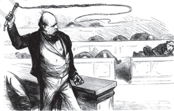
Fig. 13 – Caricature of Otto von Bismarck in the German reichstag (parliament), from Figaro, Vienna, 5 March 1870.

During the 1830s, Giuseppe Mazzini had sought to put together a coherent programme for a unitary Italian Republic. He had also formed a secret society called Young Italy for the dissemination of his goals. The failure of revolutionary uprisings both in 1831 and 1848 meant that the mantle now fell on Sardinia-Piedmont under its ruler King Victor Emmanuel II to unify the Italian states through war. In the eyes of the ruling elites of this region, a unified Italy offered them the possibility of economic development and political dominance.