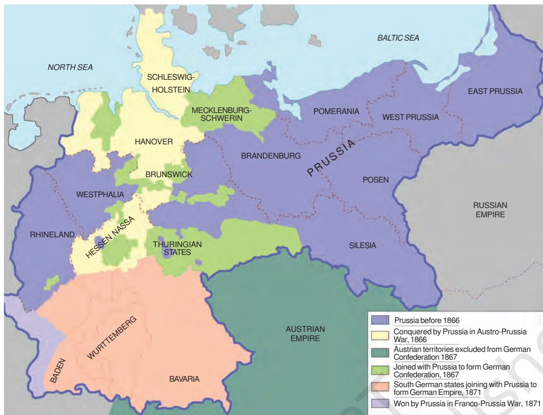
Fig. 12 – Unification of Germany (1866-71).