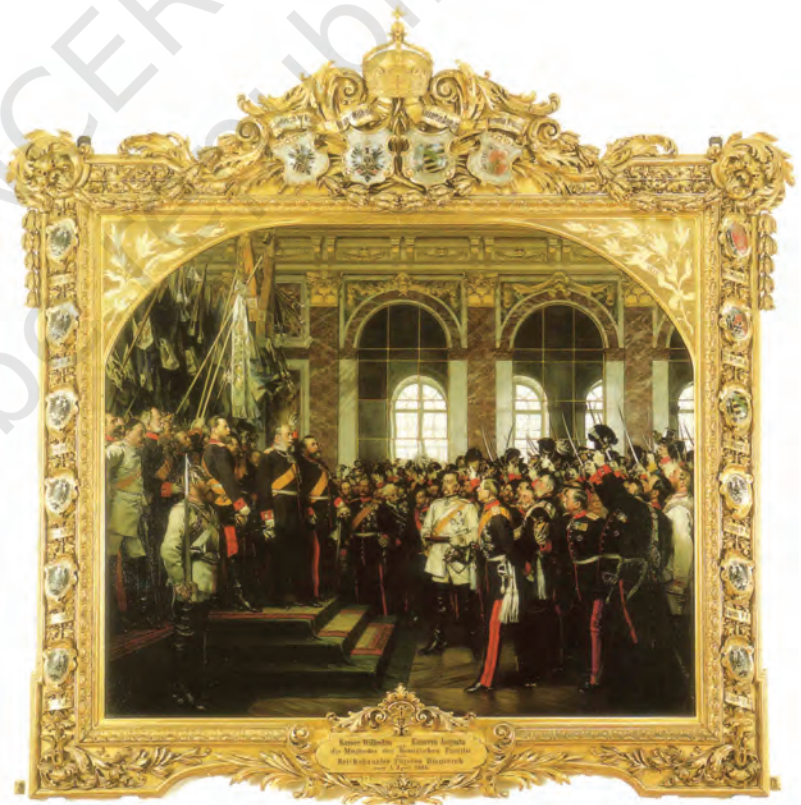
Fig. 11 – The proclamation of the German empire in the Hall of Mirrors at Versailles, Anton von Werner. At the centre stands the Kaiser and the chief commander of the Prussian army, General von Roon. Near them is Bismarck. This monumental work (2.7m x 2.7m) was completed and presented by the artist to Bismarck on the latter's 70th birthday in 1885.

The nation-building process in Germany had demonstrated the dominance of Prussian state power. The new state placed a strong emphasis on modernising the currency, banking, legal and judicial systems in Germany. Prussian measures and practices often became a model for the rest of Germany.