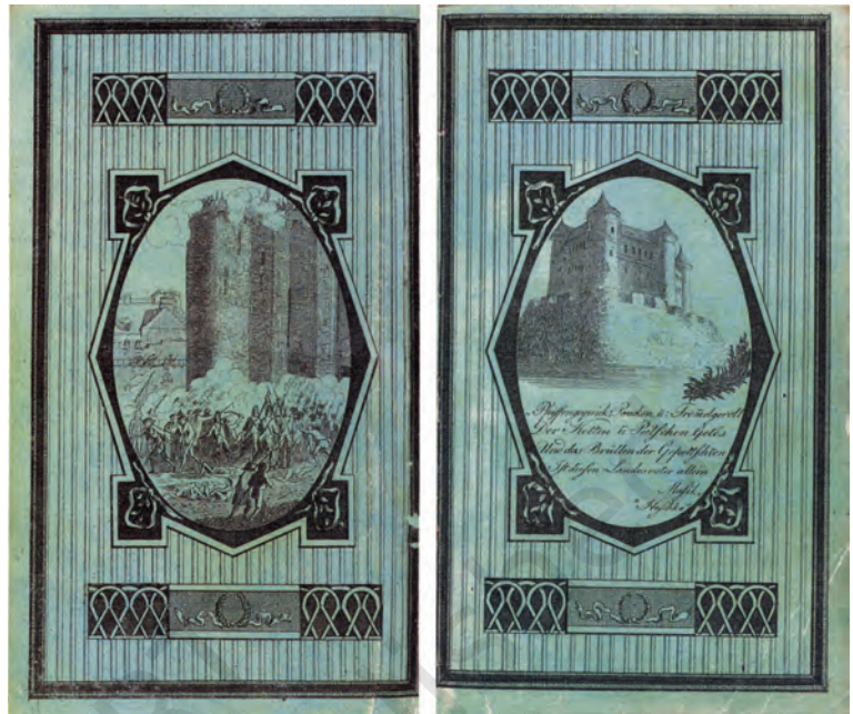
Fig. 2 — The cover of a German almanac designed by the journalist Andreas Rebmann in 1798.

When the news of the events in France reached the different cities of Europe, students and other members of educated middle classes began setting up Jacobin clubs. Their activities and campaigns prepared the way for the French armies which moved into Holland, Belgium, Switzerland and much of Italy in the 1790s. With the outbreak of the revolutionary wars, the French armies began to carry the idea of nationalism abroad.